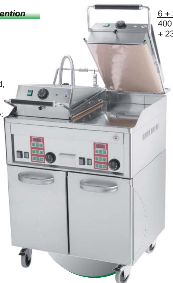
Dimensions (cm): 66 x 66 x 105